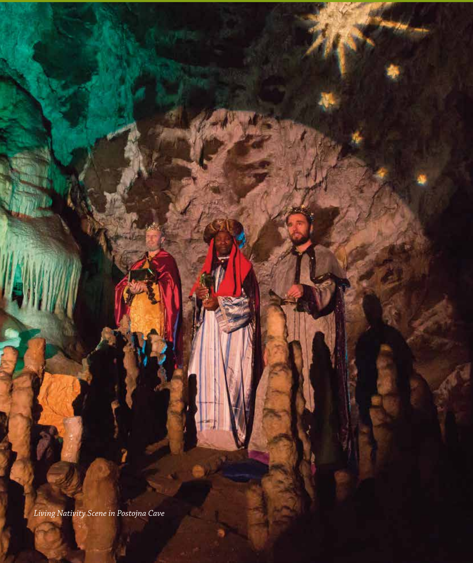
Living Nativity Scene in Postojna Cave