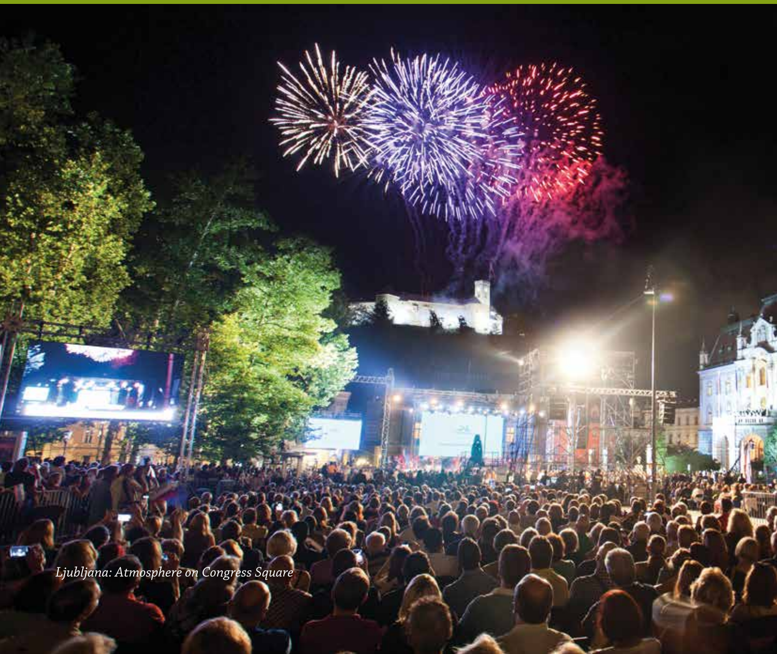
Ljubljana: Atmosphere on Congress Square