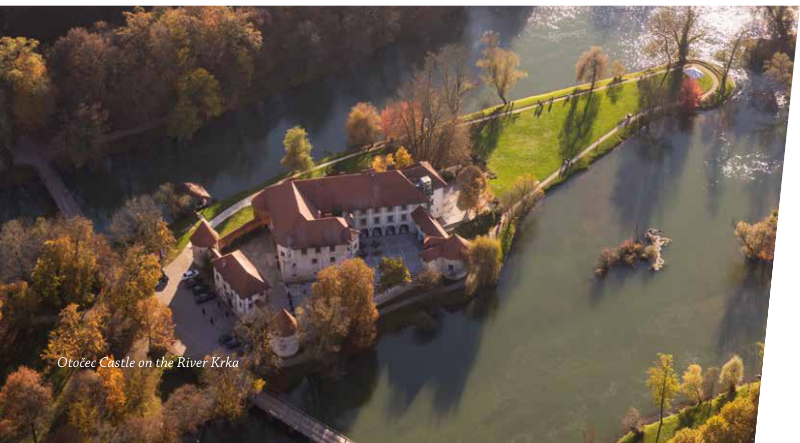
Otočec Castle on the River Krka

If you desire some romance, don't miss exploring historical towns and cities. You can find picturesque old town centres behind fortified walls or at the foot of hills with castles. Town castles now resemble time machines that take visitors into the past. Bled Castle nestled on top of a high cliff, Ljubljana Castle hosting numerous events and historical exhibitions, the Old Castle in Celje with the story of the Counts of Celje, and Ptuj Castle , once owned by the Ptuj Archdiocese form a recognisable medieval castle quartet. Castles all over Slovenia tell stories of knights and barons. In the 16th century, many were transformed into defence fortifications, and in recent centuries they experienced periods of renovation. Khislstein Castle in Kranj refurbished its former defence facilities into a museum and a venue for cultural events. Nearby Brdo Castle is the most prestigiously furnished castle and Slovenia's official protocol building in the middle of a park with 11 lakes. Lendava Castle and Murska Sobota Castle became centres of culture and art with museums and galleries. Gewerkenegg Castle in Idrija, a former mining castle, represents a mercury mine heritage, while Loka Castle dominating above the town centre of picturesque Škofja Loka depicts Loka's culture through time.