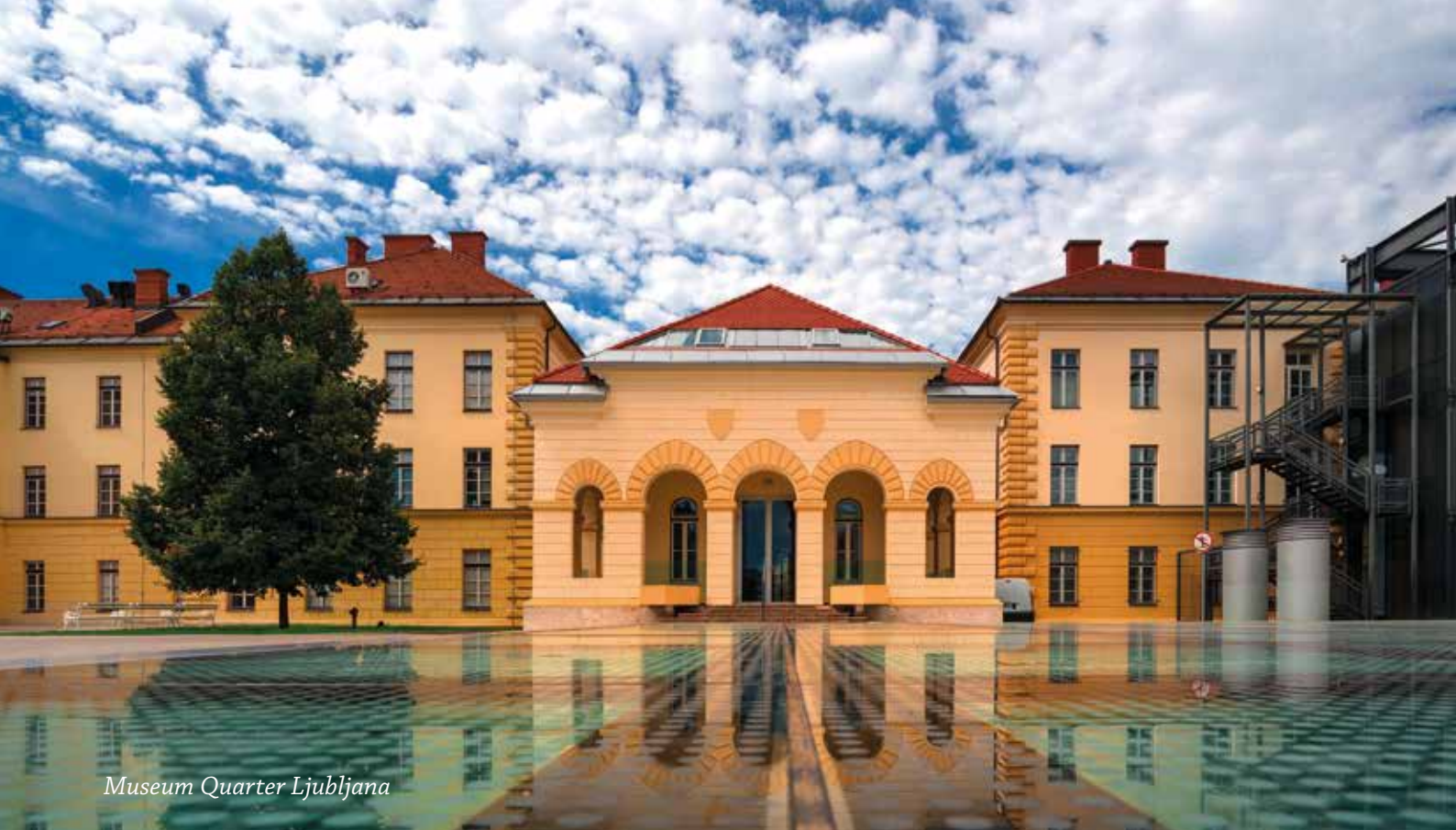
Museum Quarter Ljubljana