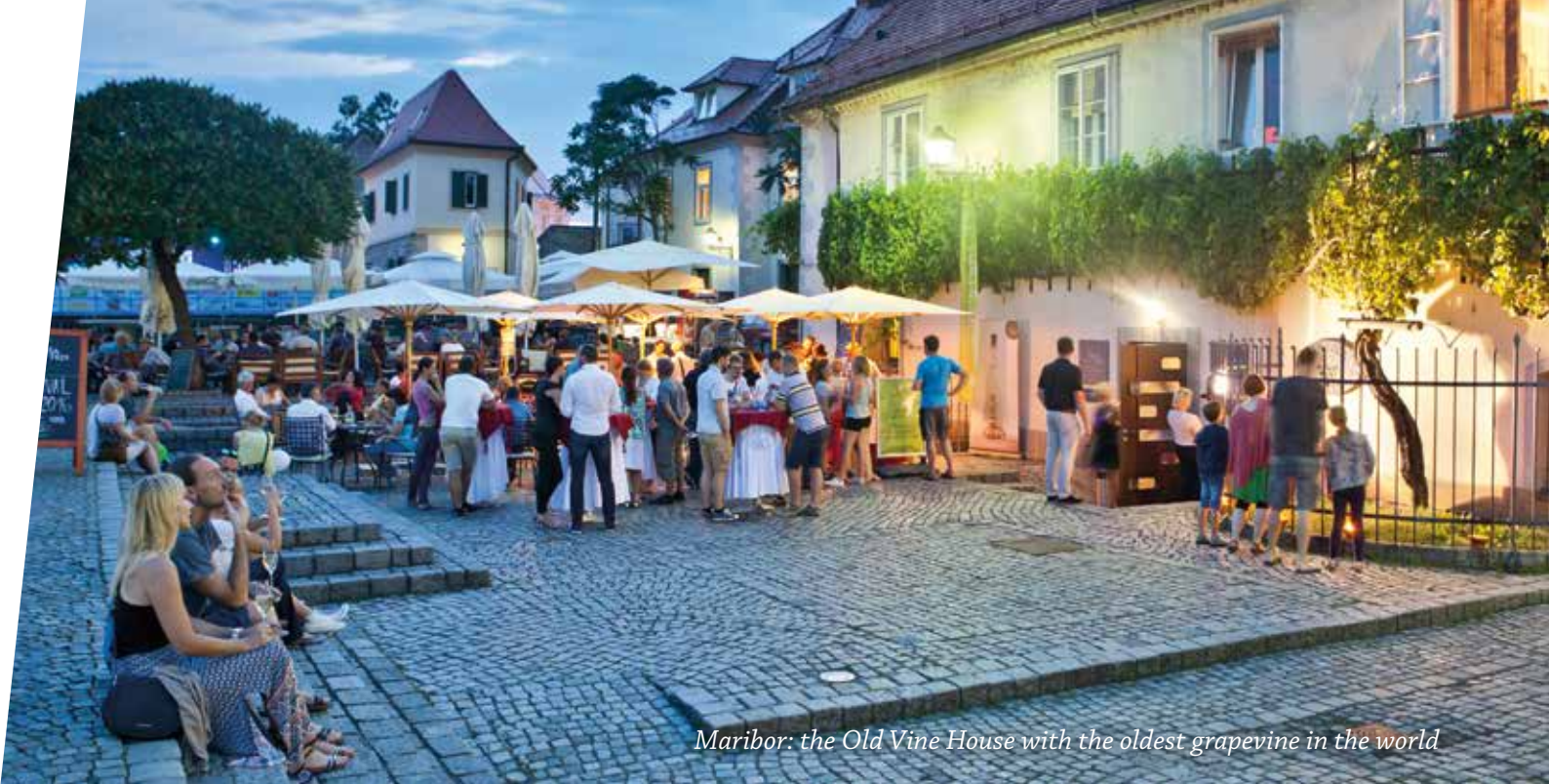
Maribor: the Old Vine House with the oldest grapevine in the world