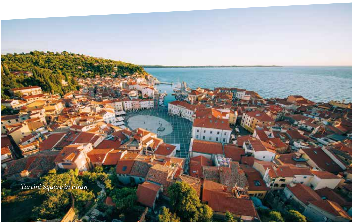
Tartini Square in Piran