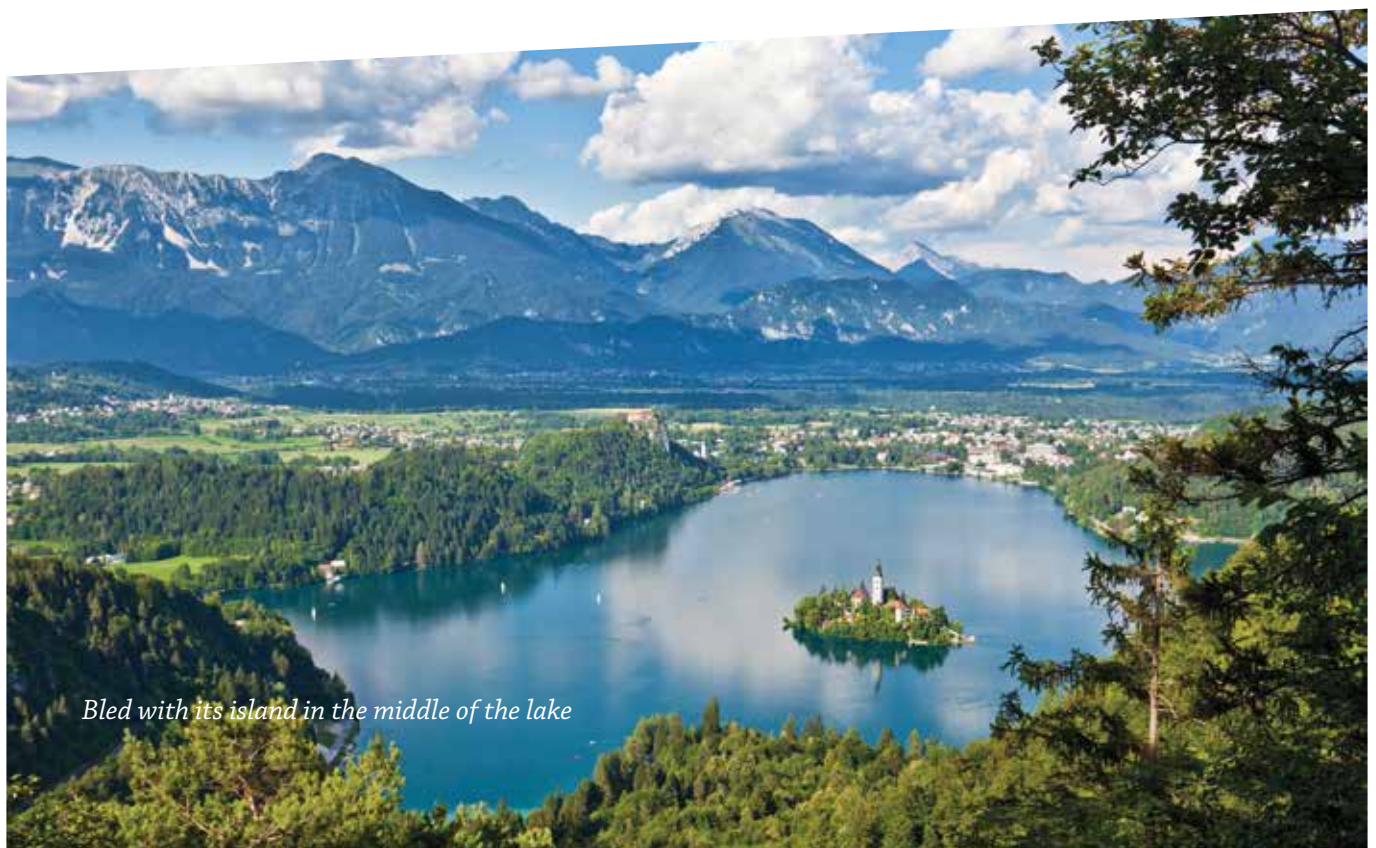
Bled with its island in the middle of the lake