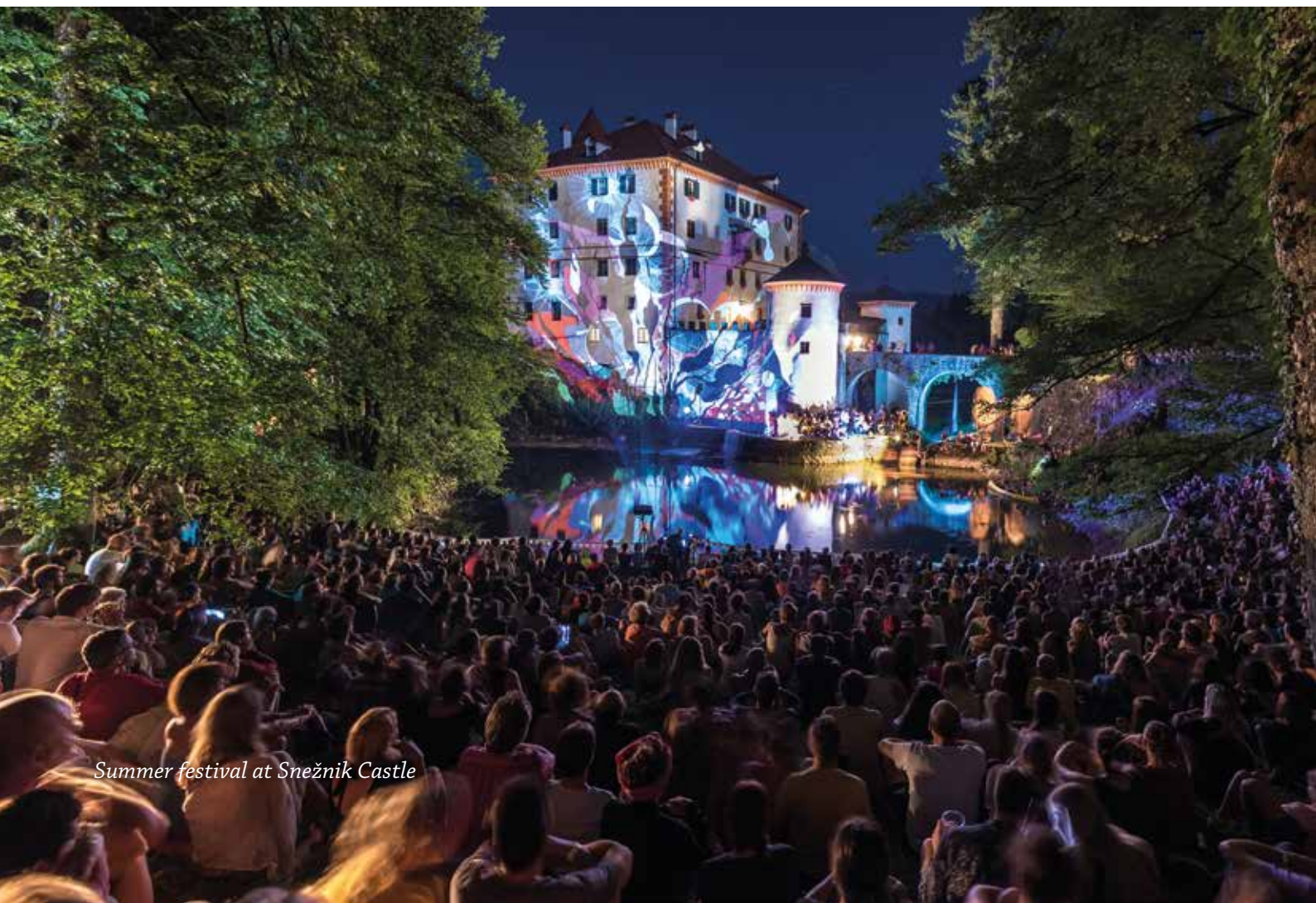
Summer festival at Snežnik Castle

In summer, it may happen that, while exploring the lovely attractions of old town centres around Slovenia, you encounter mesmerising fire. In this case, this must certainly be the street artists from the Ana Desetnica Festival . At this international street theatre festival, you can admire fire eaters, jugglers, puppeteers, acrobats, dancers, and musicians. Ana Desetnica also has a younger sister, Ana Mraz , which takes place in Ljubljana during the December holiday celebrations.