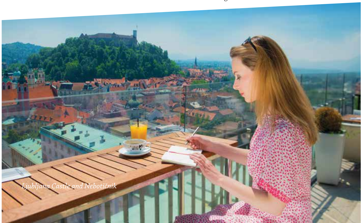
Ljubljana Castle and Nebotičnik