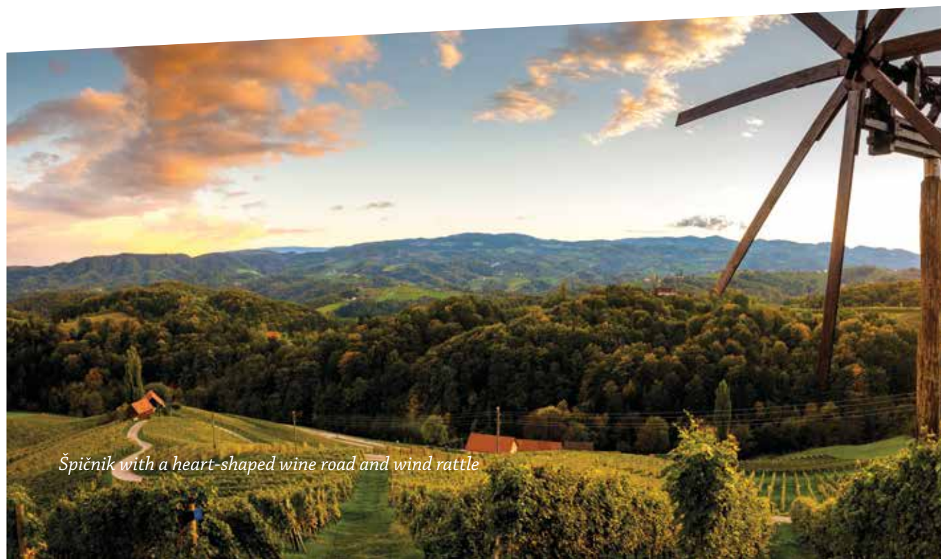
Špičnik with a heart-shaped wine road and wind rattle